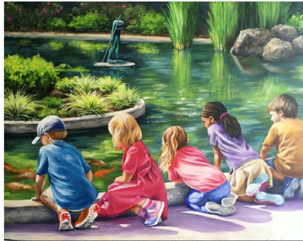
“Kids Feeding Koi “

The fall splendor of the Arboretum gardens provides a perfect backdrop for the largest coastal outdoor art show and sale in North Carolina. The Friends of the New Hanover County Arboretum and the New Hanover County Cooperative Extension, in conjunction with the Wilmington Art Association, present this three-day Art Show and sale. Proceeds support the Arboretum’s projects and programs to help keep these gardens one of the most beautiful gems in New Hanover County.